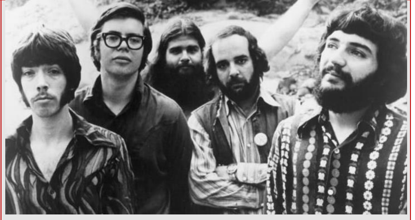
CONSTITUTIONALISM.....is the new counterculture.