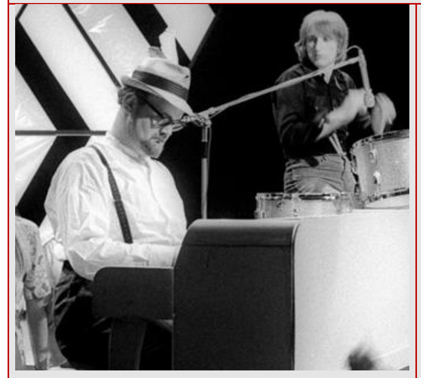
\underline{ \text{SYNCHRONICITY} } \text{ and } \underline{ \text{ELECTRIC UNIVERSE}} \, .

.....starts with one person, one relationship, one family, one neighbor, one neighborhood, one village, one community, one city, one state, one nation, at a time.... simultaneously.