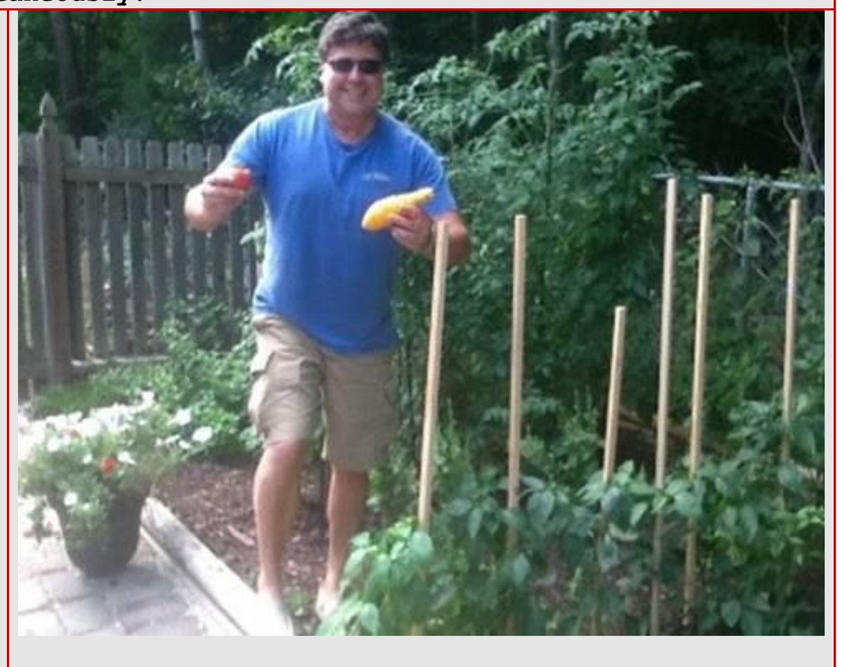
X = New Republic = REGENERATIVE Globalism. = BREAKTHROUGH ENERGY. : transform the world. : HIGH VOLTAGE Go.Out.Do.

In the New Republic, all good people in the arena enjoy resuming the restoration of the Constitutional republic FROM JFK's point of interruption, can see for miles and miles, and enjoy Liberty in building out properties and the local means of production, with the capability to sow, nurture, grow, harvest, store, cook, engineer, design, program, automate, construct, process, raise, teach, counsel, hunt, defend, provide, debate, organize, compose, perform, worship, dance, laugh, love, celebrate, and sustain. Members enjoy a career in methods of spontaneous cooperation in the discovery and development of processes that achieve a well-defined whole!!