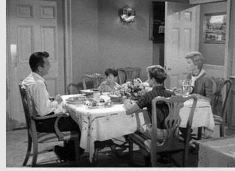
"There are only two things we should fight for. One is the defense of our homes and the other is the <u>Bill of Rights</u>." - <u>Smedley Butler, 1935.</u>

"Wally, Beaver, there are starving people in China. We don't waste food. Now clean your plates!"