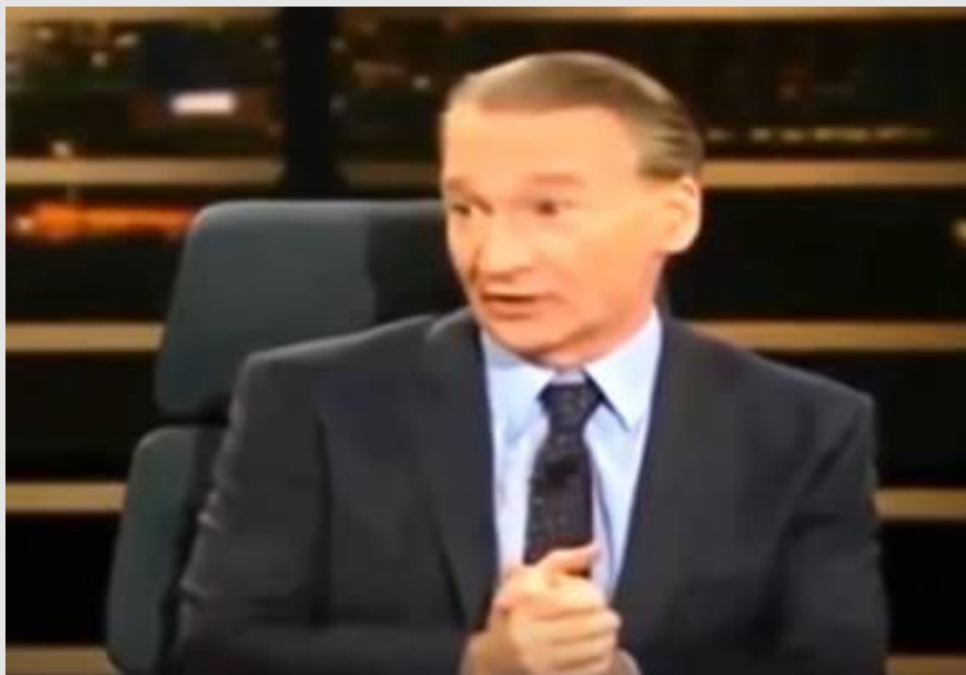
Bill Maher: net worth $100 million. Sent from the New Republic.