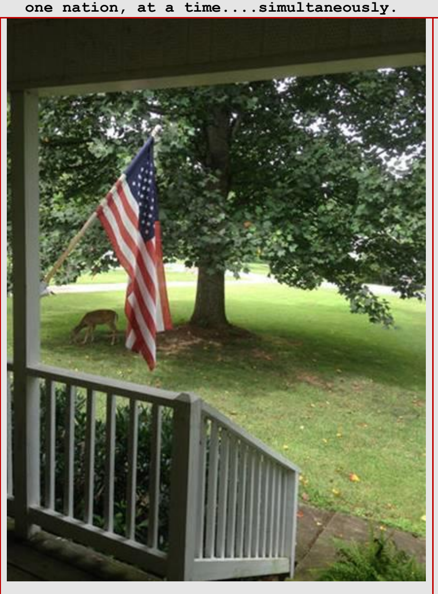
There are only two things we should <a href="fight">fight</a> for. One is the defense of our <a href="homes">homes</a> and other is the <a href="Bill of Rights">Bill of Rights</a>." Smedley Butler.

WEALTH WITH PHILANTHROPY is like Capitalism WITH Conscience, is like Government WITH Oversight, is like Eisenhower's Farewell Address, and is IMPLEMENTED with the launch of the New Republic!