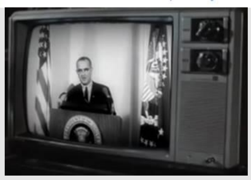
CONSTITUTIONALISM.....is the new counterculture.