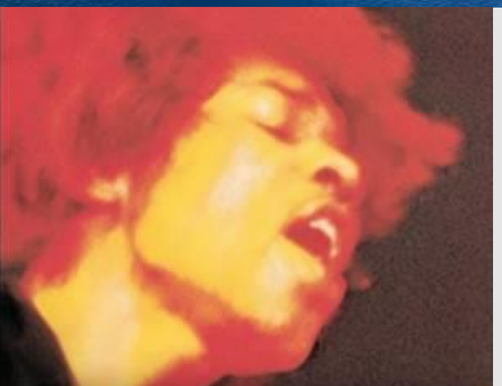
Sent from the New Republic. playlist.