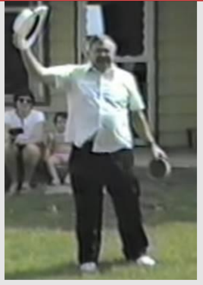
Sent from the New Republic. playlist.