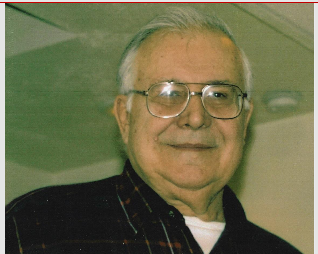
Understand the Hegelian Dialectic of Problem: Reaction: Solution.

.....starts with one person, one relationship, one family, one neighbor, one neighborhood, one village, one community, one city, one state, one nation, at a time...simultaneously.