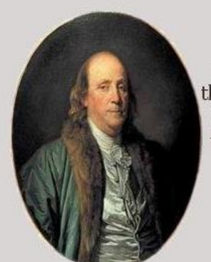
When the people find they can vote themselves money, that will herald the end of the republic. ~ Benjamin Franklin

In the New Republic, Independent Enlightened Commoners enjoy CHOOSING to build out DOMESTIC off-grid residential and commercial infrastructure, local regenerative, sustainable, renewable supply chains AND communities, in locales where the population of butterflies, hummingbirds, bluebirds, and deer