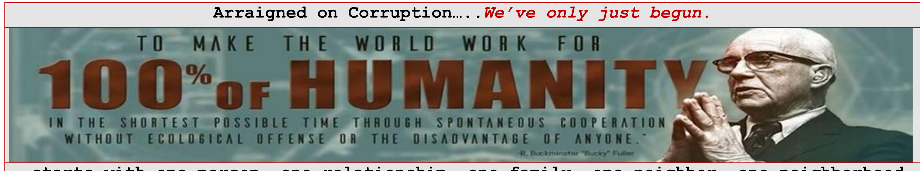
.....starts with one person, one relationship, one family, one neighbor, one neighborhood, one village, one city, one state, one nation, at a time....simultaneously.