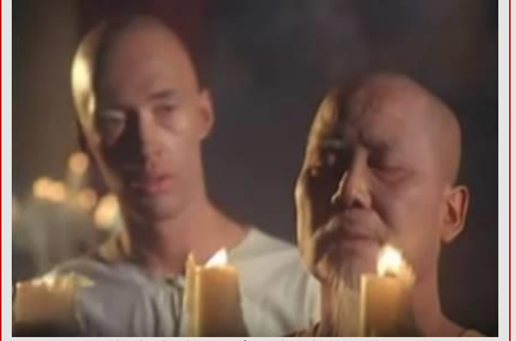
SYNCHRONICITY and ELECTRIC UNIVERSE.

.....starts with one person, one relationship, one family, one neighbor, one neighborhood, one village, one community, one city, one state, one nation, at a time....simultaneously.