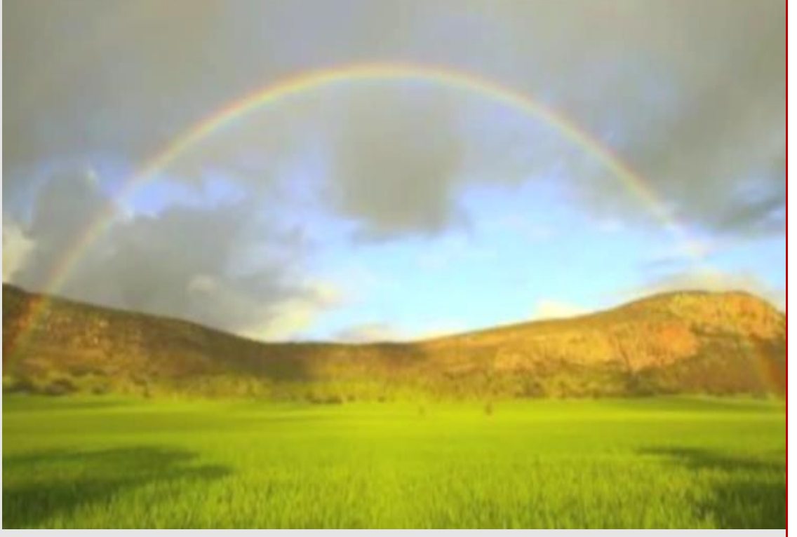
CONSTITUTIONALISM....is the new counterculture.