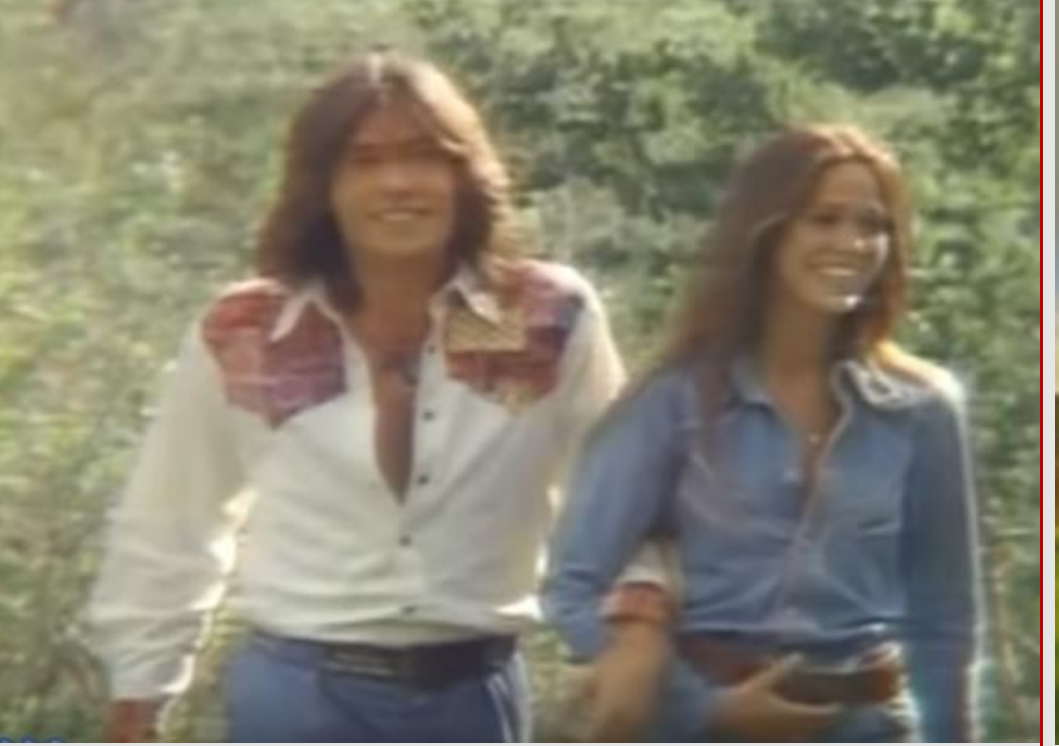
Sent from the New Republic. playlist.