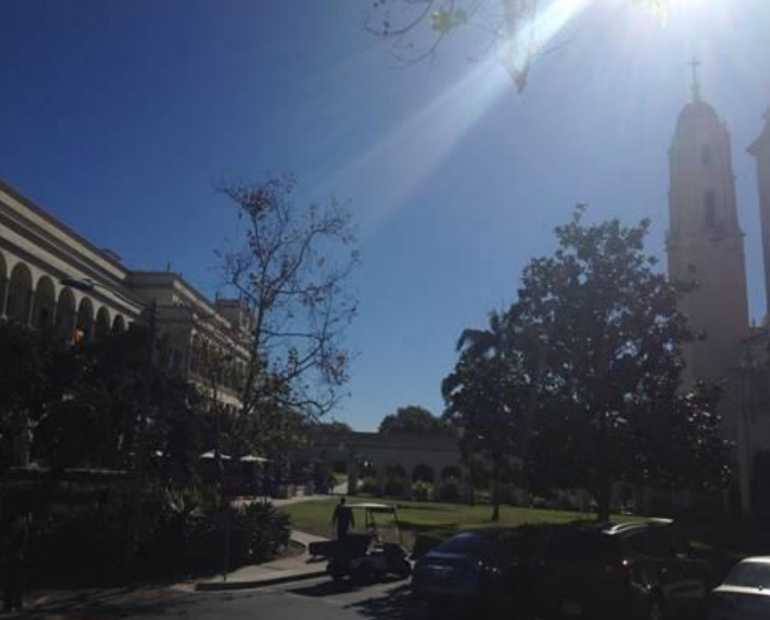
Sent from the New Republic.