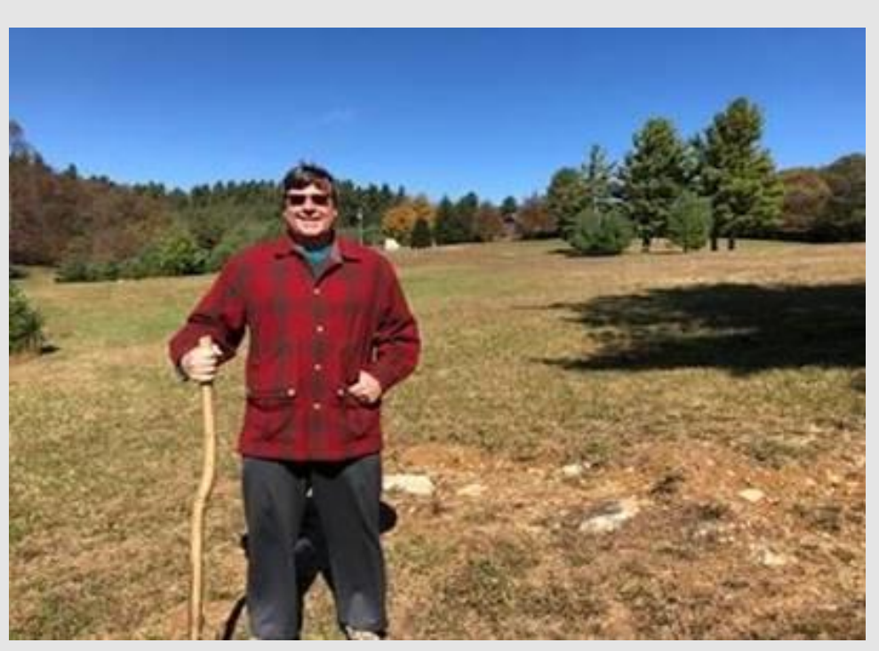
Sent from the New Republic. playlist.