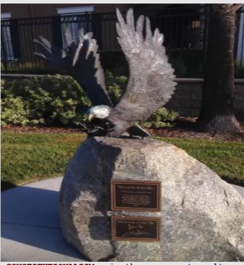
CONSTITUTIONALISM.....is the new counterculture.