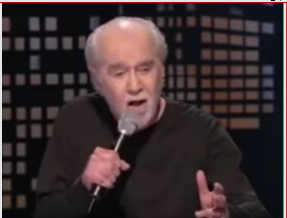
SYNCHRONICITY and ELECTRIC UNIVERSE .

.....starts with one person, one relationship, one family, one neighbor, one neighborhood, one village, one community, one city, one state, one nation, at a time....simultaneously.