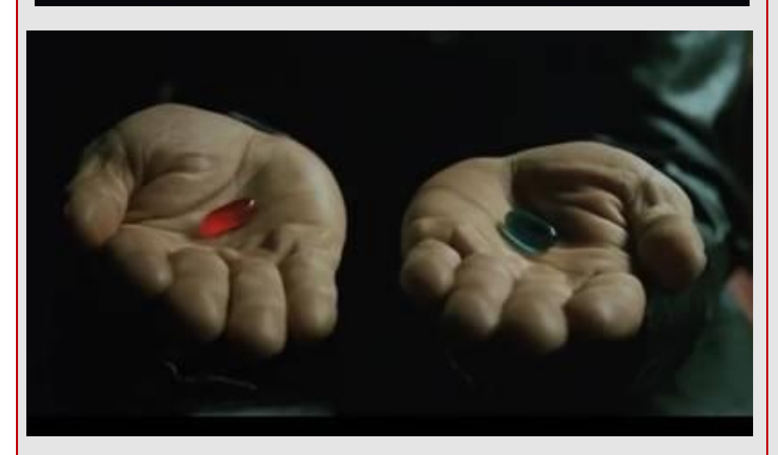
SYNCHRONICITY and ELECTRIC UNIVERSE.

THE ILLITERATE OF THE 21ST CENTURY WILL NOT BE THOSE WHO CANNOT READ OR WRITE, BUT THOSE WHO CANNOT UNLEARN THE MANY LIES THEY'VE BEEN TAUGHT TO BELIEVE.