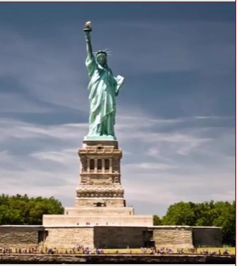
CONSTITUTIONALISM.....is the new counterculture.