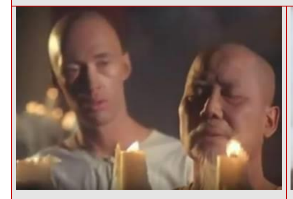
CONSTITUTIONALISM.....is the new counterculture.

.....starts with one person, one relationship, one family, one neighbor, one neighborhood, one village, one community, one city, one state, one nation, at a time....simultaneously.