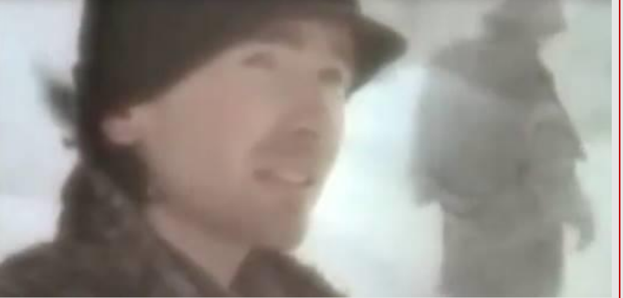
Sent from the New Republic.