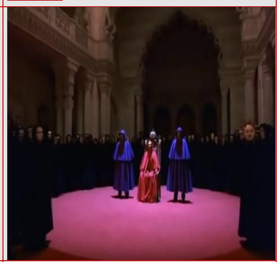
CONSTITUTIONALISM.....is the new counterculture.