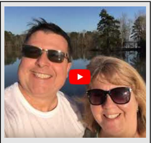
In the <u>NEW REPUBLIC 2.0</u>, imperfect people form a more perfect union, with <u>Providence</u>. Core principles of community-based prosperity, LOCAL commerce, supply, <u>brotherhood</u>, diversity, inclusion, philanthropy, defense, disaster-prevention, distributed power, MEANS OF CONSTRUCTION, the <u>Bill of</u> Individual Rights, sustainability and resiliency, all calibrated to LOVE, JOY, GRATITUDE, AND PEACE!

Within You... The Garden of Eden... Without You... Easter Island.