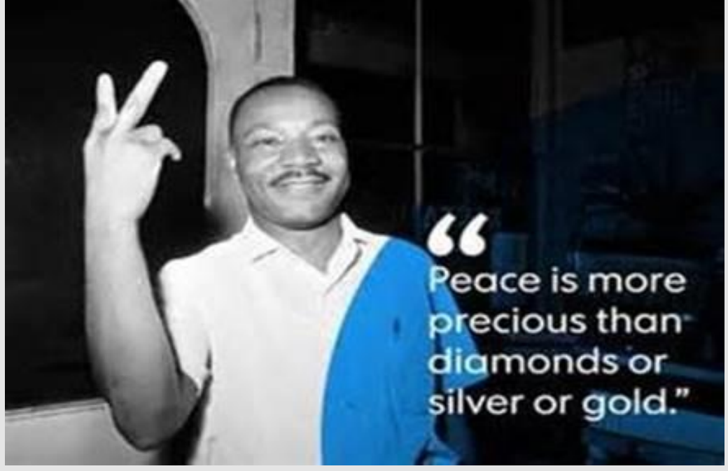
Sent from the New Republic.

CONSTITUTIONALISM. ... is the new counterculture.