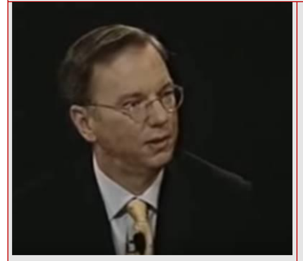
CONSTITUTIONALISM.....is the new counterculture.

.....starts with one person, one relationship, one family, one neighbor, one neighborhood, one village, one community, one city, one state, one nation, at a time....simultaneously.