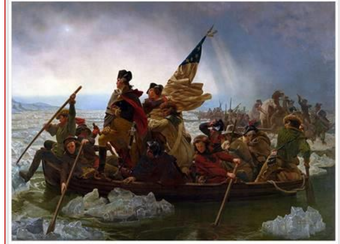
Home > Analysis > The Hi-Tech Traditionalist: Is America's Military Loyal To Its Commander In Chief?

.....starts with one person, one relationship, one family, one neighbor, one neighborhood, one village, one community, one city, one state, one nation, at a time....simultaneously.