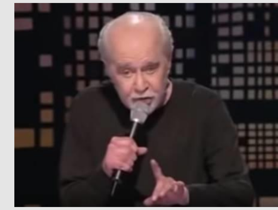
Sent from the New Republic.