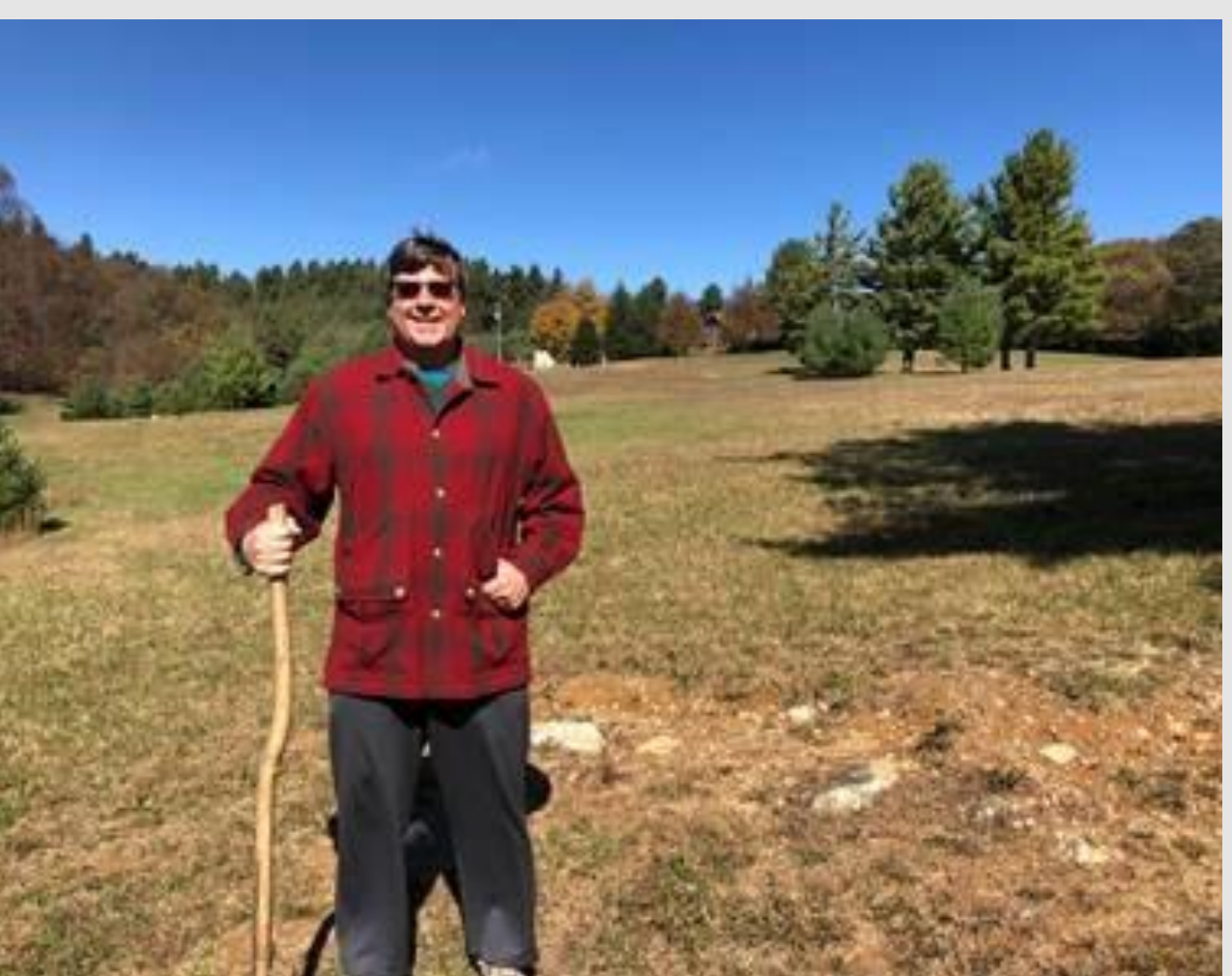
CONSTITUTIONALISM.....is the new counterculture.